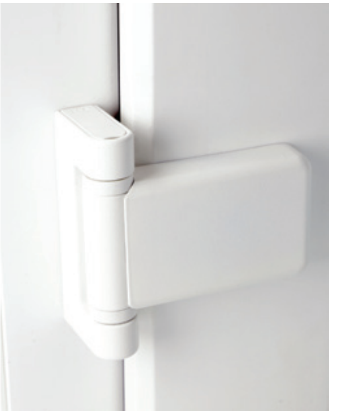
line side bulk packaging, it's a PAS 24 hinge you can fit and forget."

"It is so arduous that the received wisdom used to be that the maximum rating achievable by door hardware was bronze. Mila's SupaSecure products have obviously changed all that and we're very proud to have raised the bar in this sector."