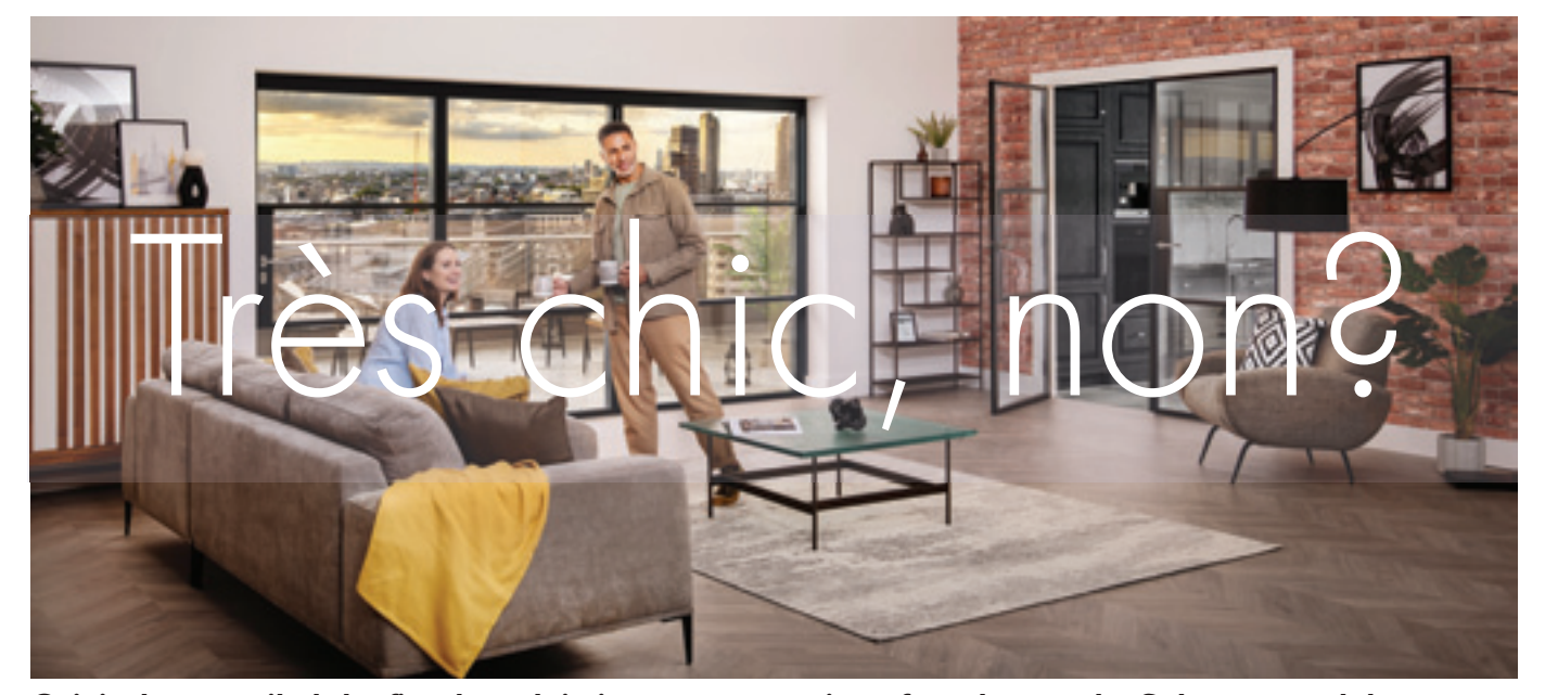
Origin, has unveiled the first launch in its new generation of products - the Soho external door

According to an Origin spokesman its new Soho external door represents the 'pinnacle of luxury fenestration'. The aluminium external bi-fold and French door system combines design with performance and quality. Designed by Origin's in-house R&D team and manufactured in the UK to customers' exact specifications, it features glazing bars and ultra-slim sightlines of 36mm. According to Origin, it is also 2025 compliant, a year earlier than required by the new building regulations.